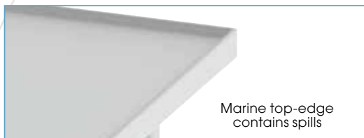
Marine top-edge contains spills